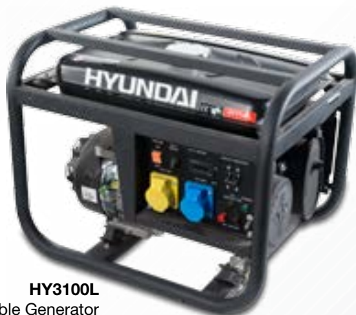
HY3100L Portable Generator