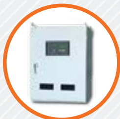
ATS, AMF (Optional) Never lose power