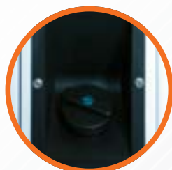
External Fuel Filler Ease of refueling