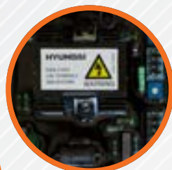
AVR Alternator Smooth Power