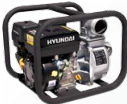
HY80 - Standard