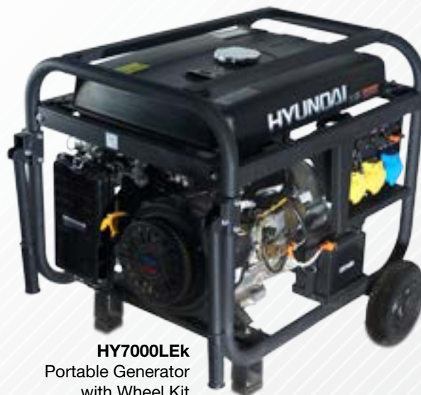
HY7000LEk Portable Generator with Wheel Kit