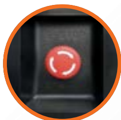
Emergency Stop For Instant Disable