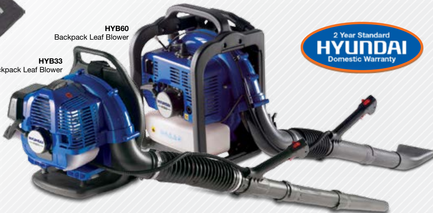
HYB33 Backpack Leaf Blower