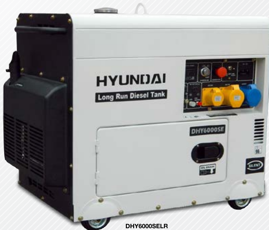
DHY6000SELR Long-run Diesel Generator