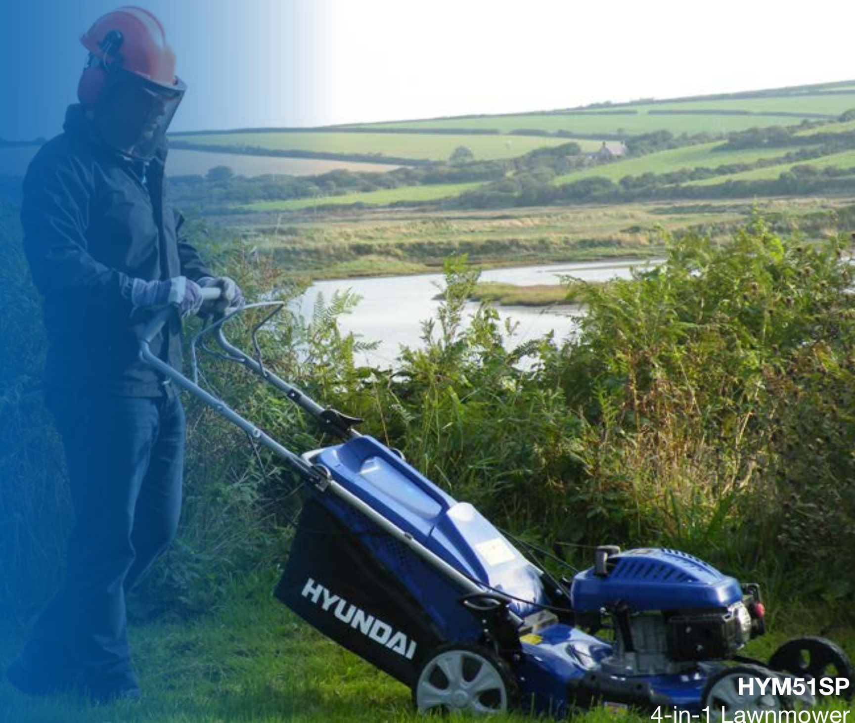
HYM51SP 4-in-1 Lawnmower