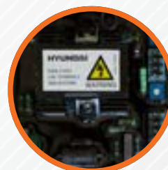
AVR Alternator Smooth Power