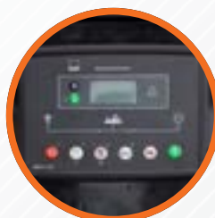
Digital Panel Full Control