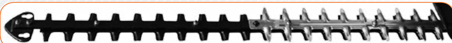
Long 720mm (28.3") Double Reciprocating Cutting Blade For even the deepest of hedges