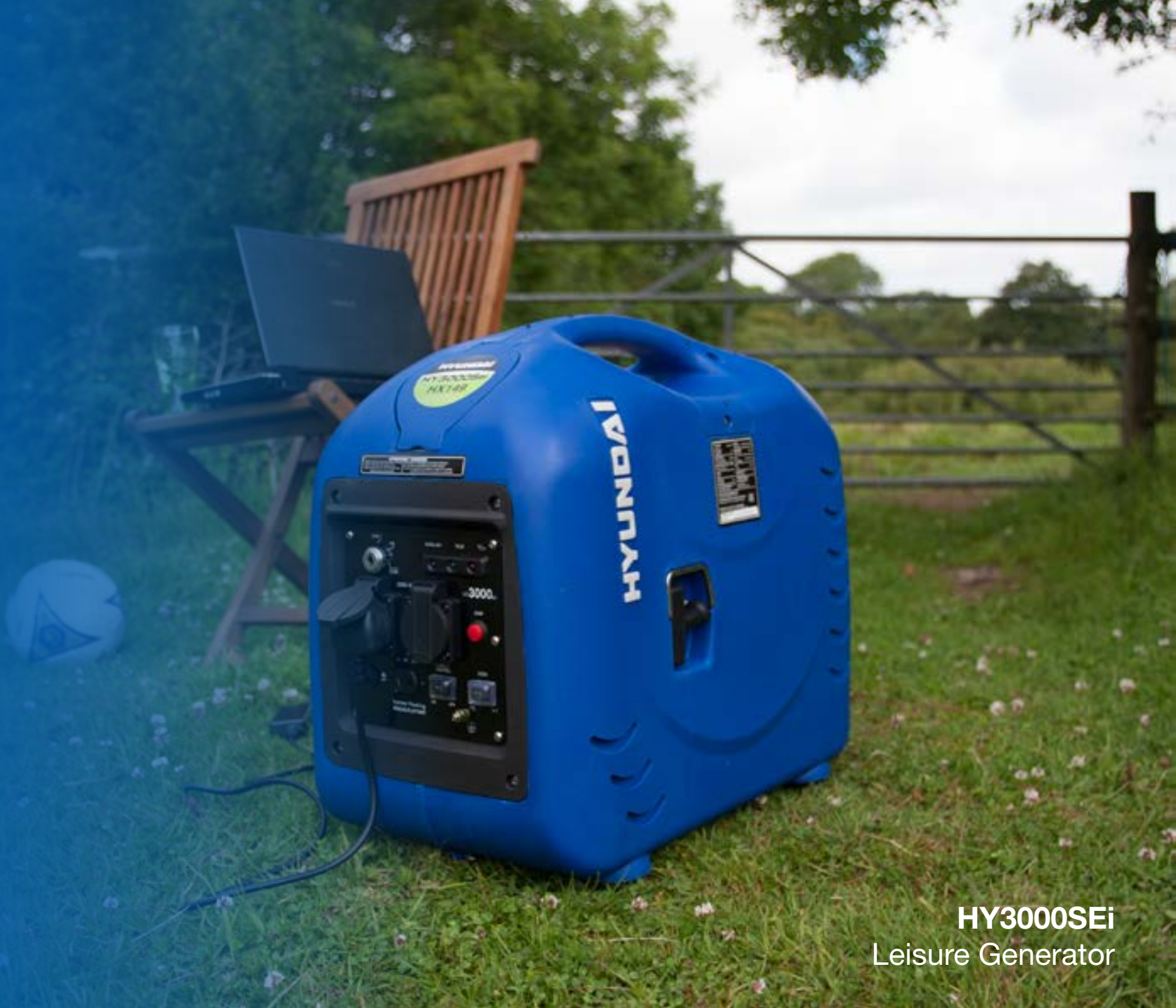
HY3000SEi Leisure Generator