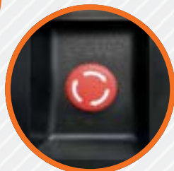
Emergency Stop For Instant Disable