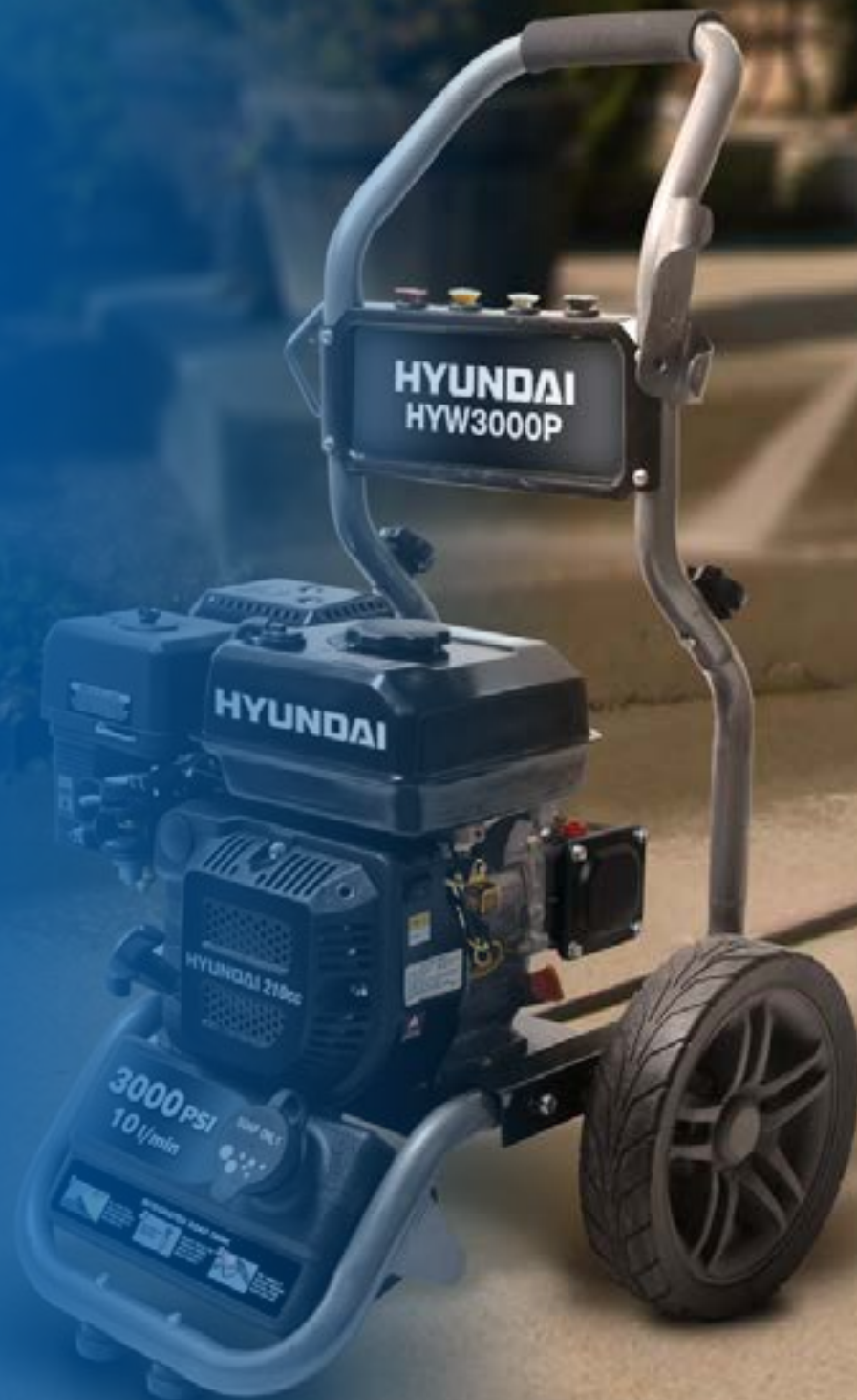
HYW3000 Pressure Washer