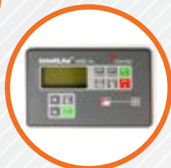
Digital Panel Full Control