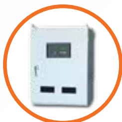
ATS, AMF (Optional) Never lose power