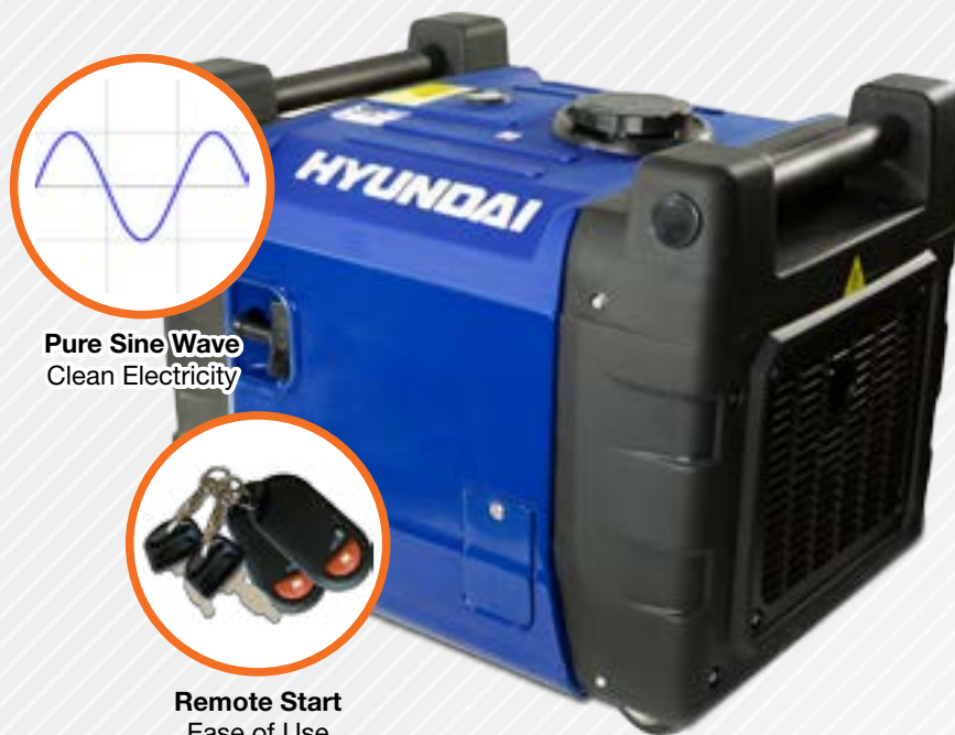
Remote Start Ease of Use